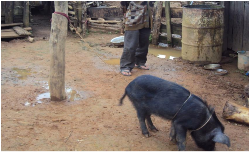
Fig a: Tethering

The pigs are allowed to scavenge for food by letting loose throughout the day and night. They mostly scavenge on food available from various sources like road side, waste lands, pasture land, homestead etc. However this system is discontinued in many parts of the country owing to scarcity of grazing area and destruction of crops and properties by the pigs.