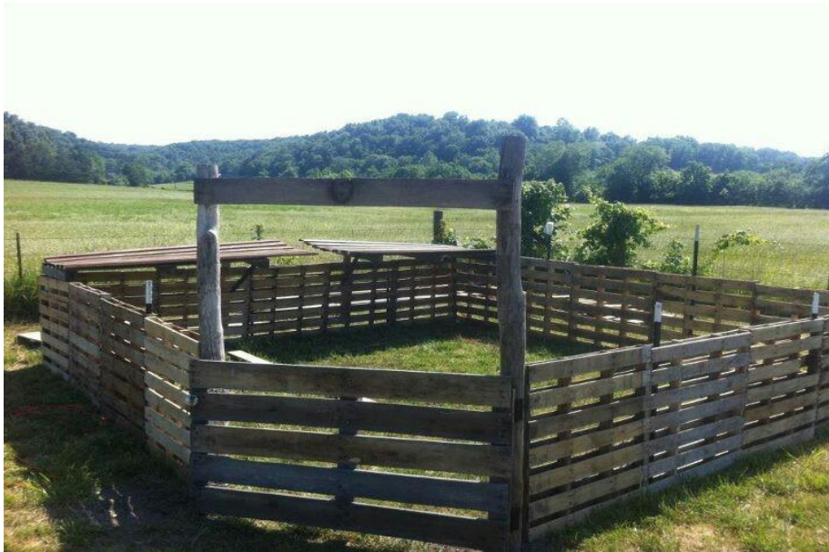
Fig c. Open enclosure