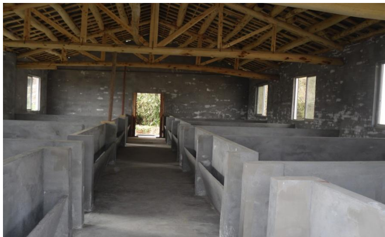
Fig e. Double row pen house

There are two types of housing system viz: single and double row. In small farms single rows are constructed whereas in commercial or government farms double row (facing each other) with a central corridor for passage of farm attendant is constructed .