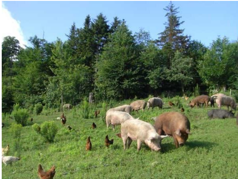
Fig b . Free ranging system

The pigs are allowed to scavenge for food by letting loose throughout the day and night. They mostly scavenge on food available from various sources like road side, waste lands, pasture land, homestead etc. However this system is discontinued in many parts of the country owing to scarcity of grazing area and destruction of crops and properties by the pigs.