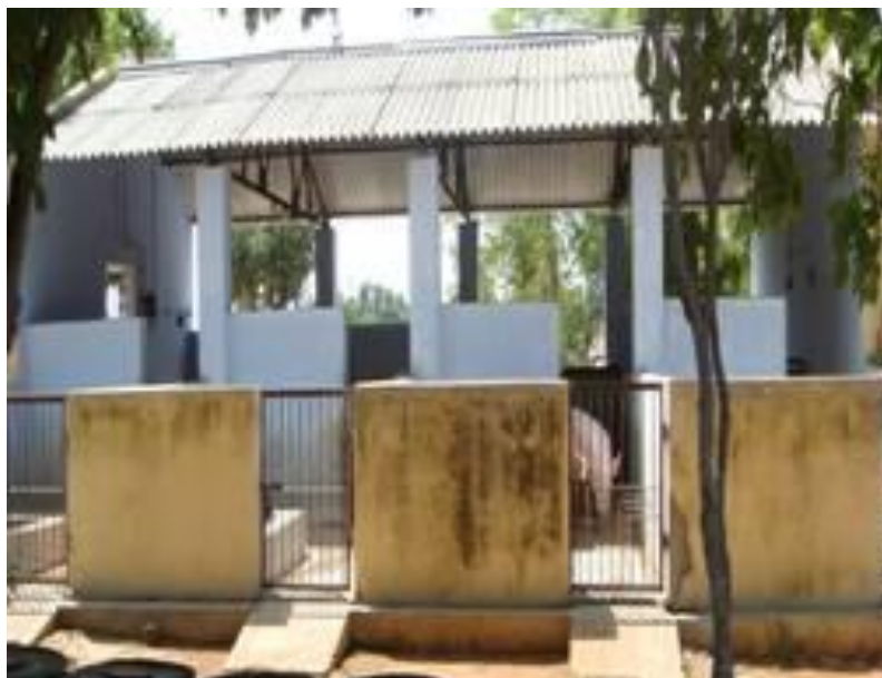
Fig d. Concrete Pig sty

This system is widely practised in organised private or government farms following all aspects of pig housing as per standard prescribed. Hygiene is well maintained with proper drainage system. There is a closed and open area, the floors are cemented and proper roofing is done. Feed is provided within the enclosure.