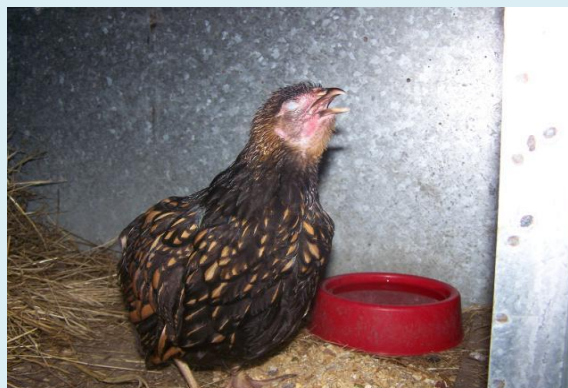
Ka jingring mynsiem da ka shyntur

(7) Ki syiar kiba ioh pang kila ban iap kyndit.