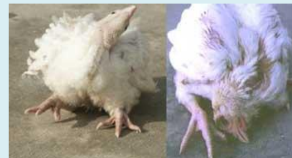
Ka jingkhyrwait jong ka ryndang.