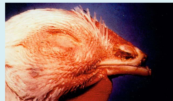
Ka jingat ki bynta jong ka kmat bad ryndang